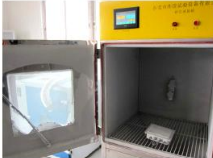
Fig 7 (Dust-proof Test)