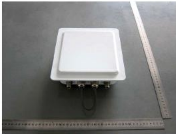
Fig 2 (After Test)