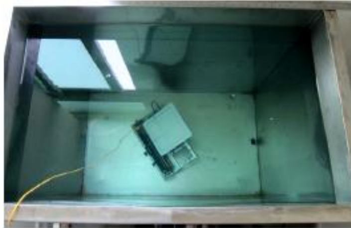
Fig 8 (Water-proof)