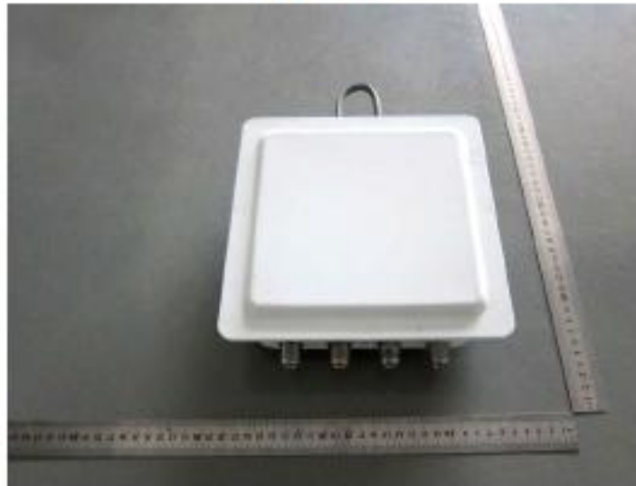
Fig 4 (After Test)