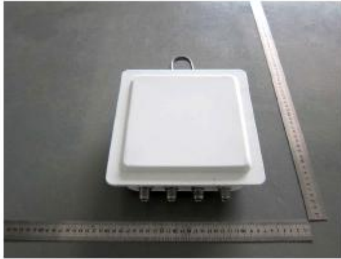
Fig 3 (Before Test)