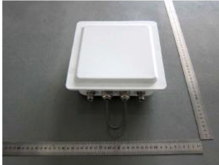
Fig 1 (Before Test)